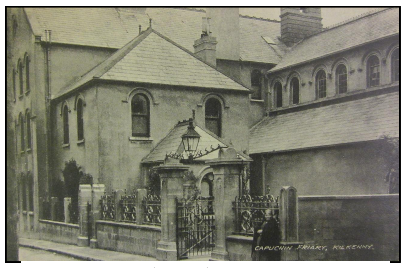
Fig. 1: Pictorial postcard print of the Church of St. Francis, Capuchin Friary, Kilkenny, c.1910