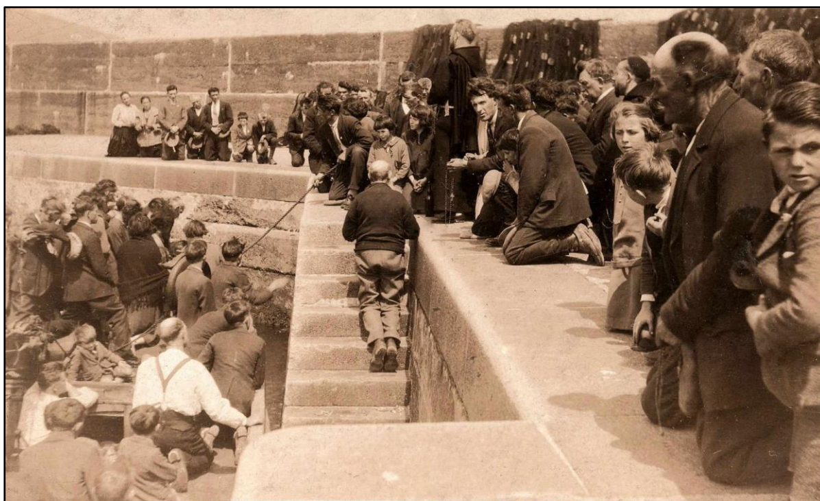
Capuchin missionaries blessing fishing boats at Brandon Pier, County Kerry, c.1930