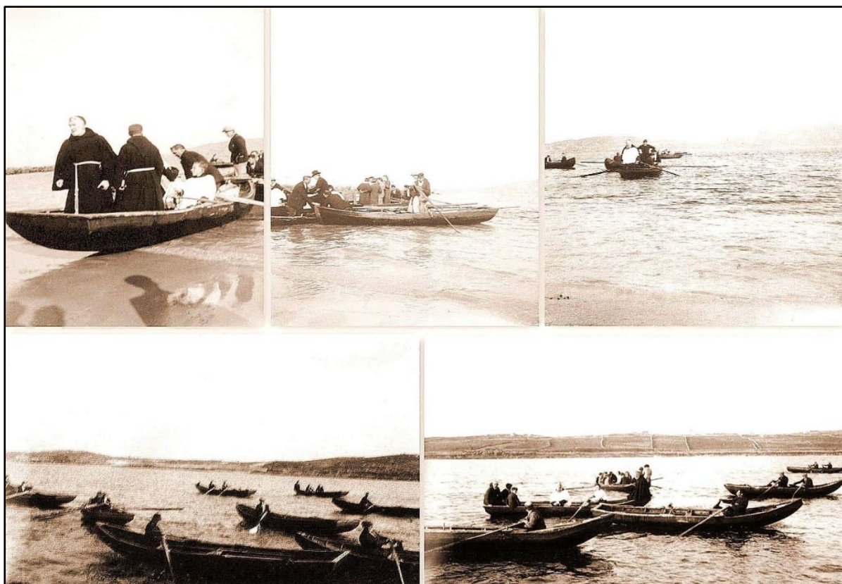
Capuchin friars using currachs for a mission to an island community off the west coast of Ireland, c.1935