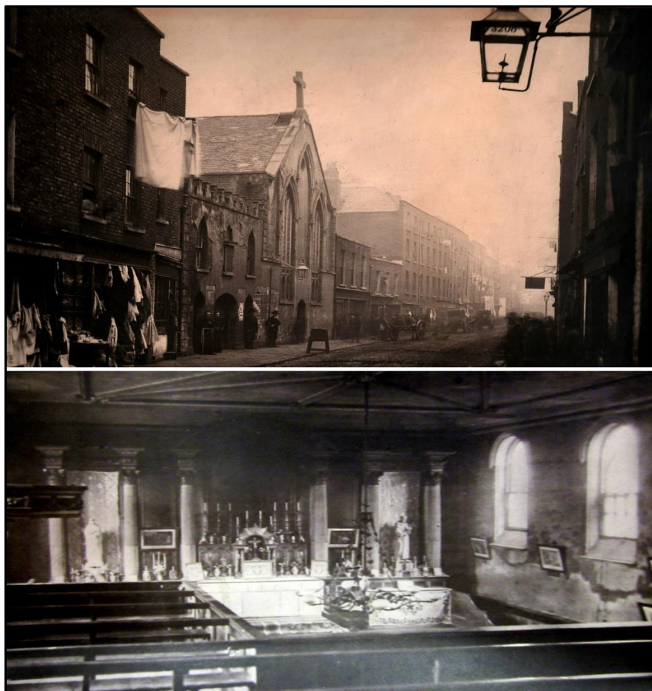
Fig. 1: Cabinet card images of the exterior and interior of the old Capuchin Chapel on Church Street in c.1861. These are photographs of the Chapel built in 1796.