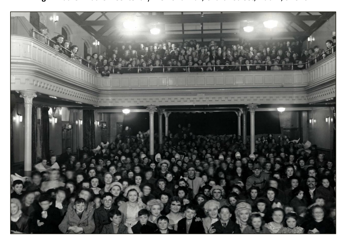
Fig. 2: A large audience at a pantomime performance in Father Mathew Hall, Dublin, c.1950.