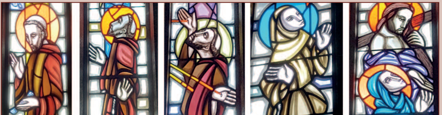
Stained glass windows from the College Chapel of St Francis College, Rochestown, Cork